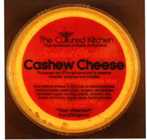
Smoked Cheddar Cashew Cheese