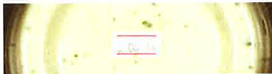
Expiration Date Label Found on Bottom of Each Container