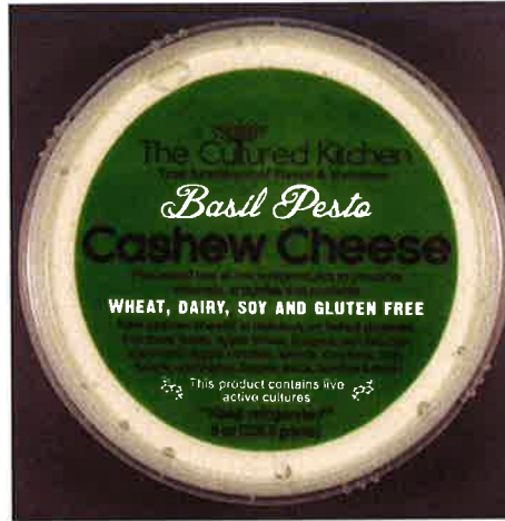
Pesto or Basil Pesto Cashew Cheese