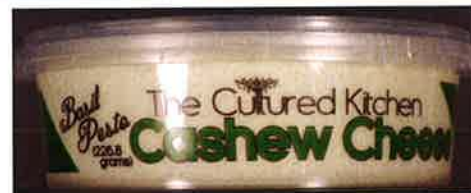
Sample Front Label Will be Similar for each product