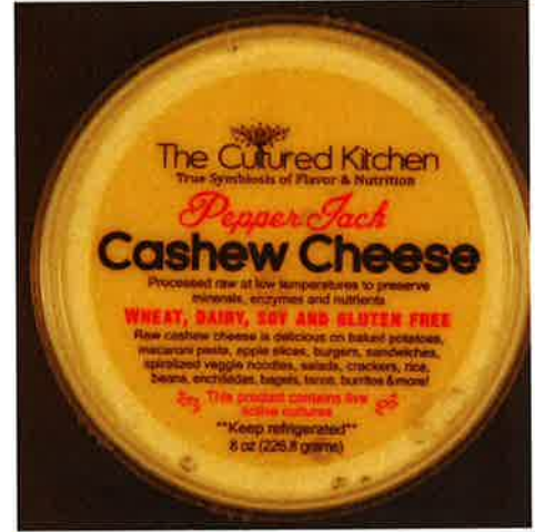
Pepper Jack Cashew Cheese