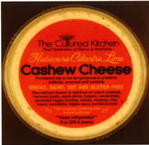
Habanero Cilantro Lime Cashew Cheese