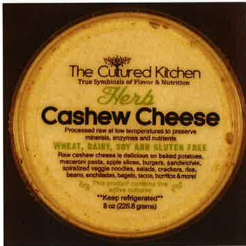
Herb Cashew Cheese