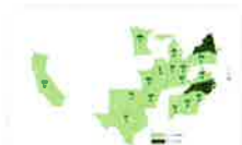
Latest Epi Curve